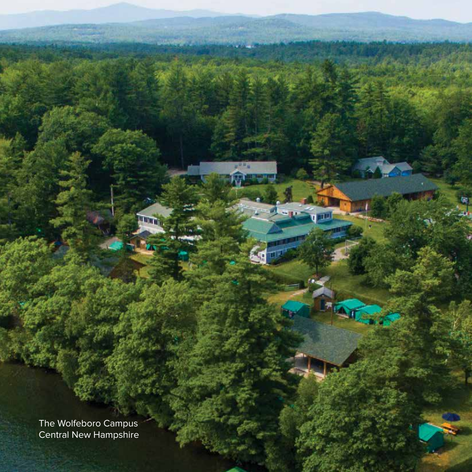
The Wolfeboro Campus Central New Hampshire