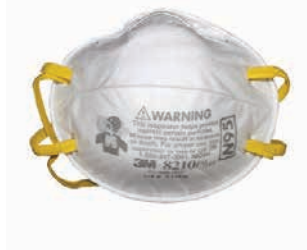
KN95 or N95