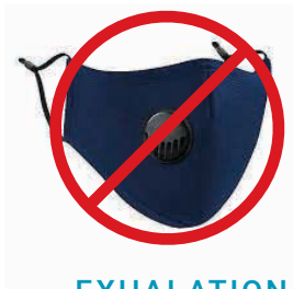
EXHALATION VALVE MASKS

Masks with exhalation valves or vents allow air to be expelled. The CDC does not recommend these types of masks because they do not prevent the person wearing the mask from transmitting COVID-19 to other. In addition, neck gaiters and bandanas should not be worn unless no other face covering listed above is available to you.