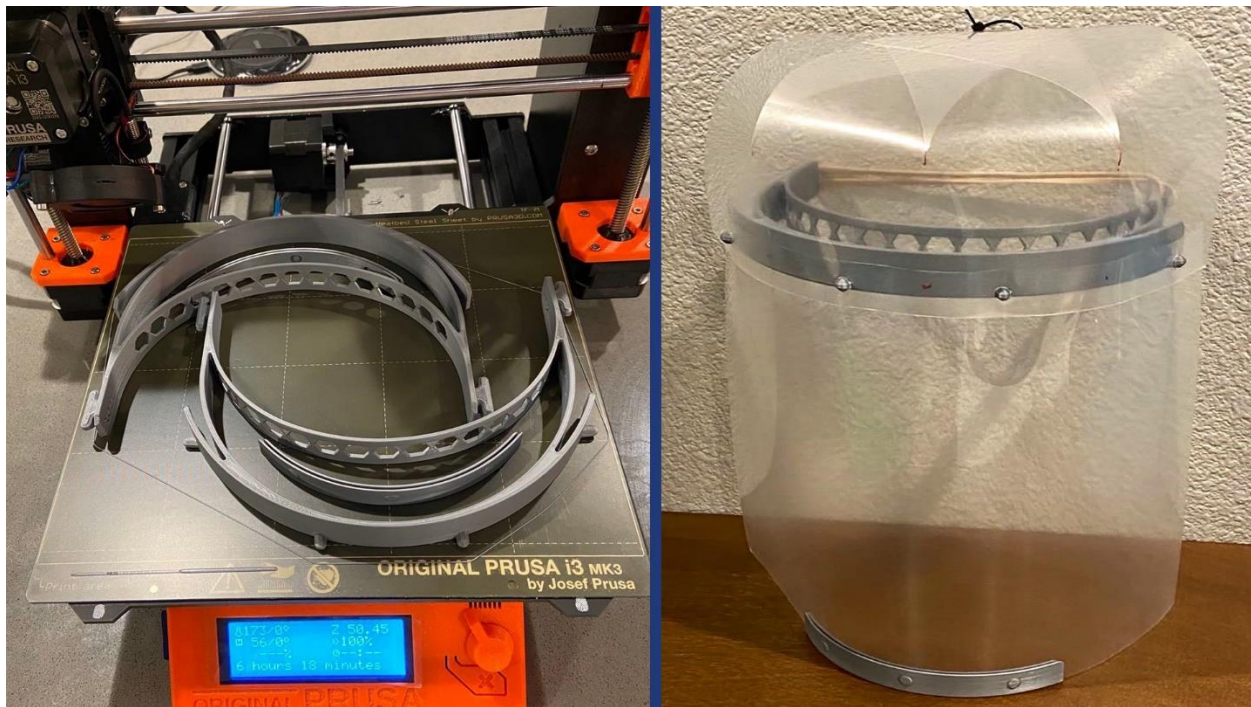
3D printer used by Terry H. to print face shields components (left). Completed face shield (right).

MILPITAS, CALIFORNIA – With the critical supply shortage of personal protective equipment (PPE), how do food banks protect their workers? Terry H., a middle school student, learned about the critical need to protect community frontline workers and immediately took action.