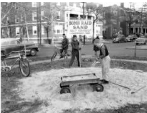
Bomb Raid Sand Pile, 1942 - Norfolk, Virginia photographer unknown

1434 East Bayview Boulevard in the Ocean View section of Norfolk, Virginia http://cdm15987.contentdm.oclc.org/cdm/ref/collection/p15987coll9/id/5679# .