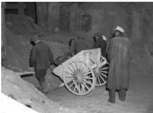
German POWs Working - Virginia Beach, Virginia