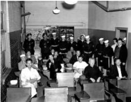
Norfolk Japanese Rounded Up - Norfolk, Virginia