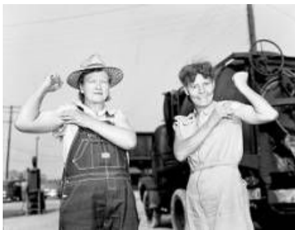
Rosies of Transit Mixed Concrete Corp - Norfolk, Virginia

http://cdm15987.contentdm.oclc.org/cdm/ref/collection/p15987coll9/id/3143# .