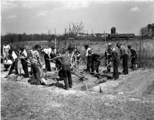
Bay View School Victory Gardens, 1943 - Norfolk, Virginia photographer unknown

1434 East Bayview Boulevard in the Ocean View section of Norfolk, Virginia http://cdm15987.contentdm.oclc.org/cdm/ref/collection/p15987coll9/id/5679# .